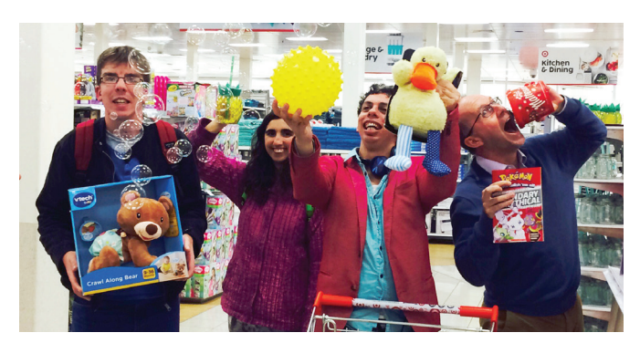
CDS Social Networking Group