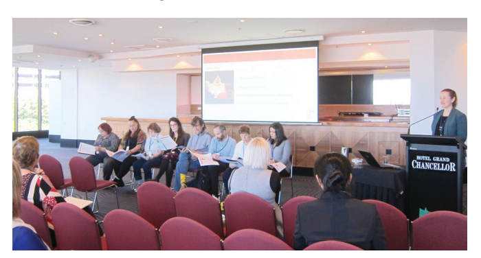
Inclusive Research Network presenting at an ASID Conference session