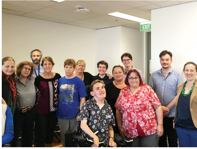
Members of the CDS Inclusive Research Network